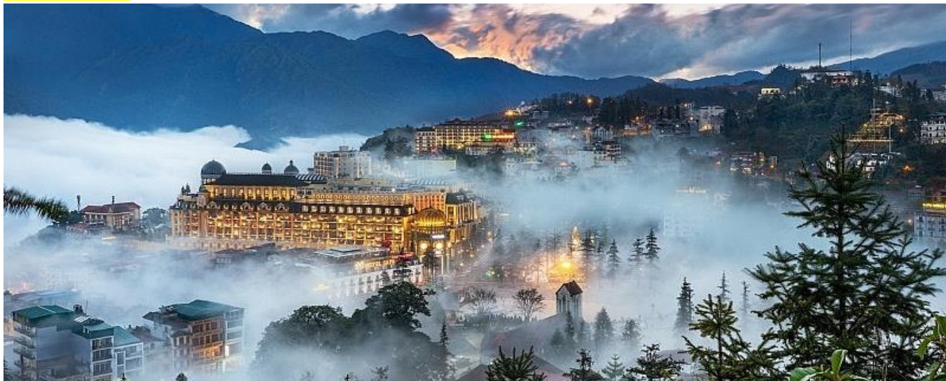
Overview of Sapa town