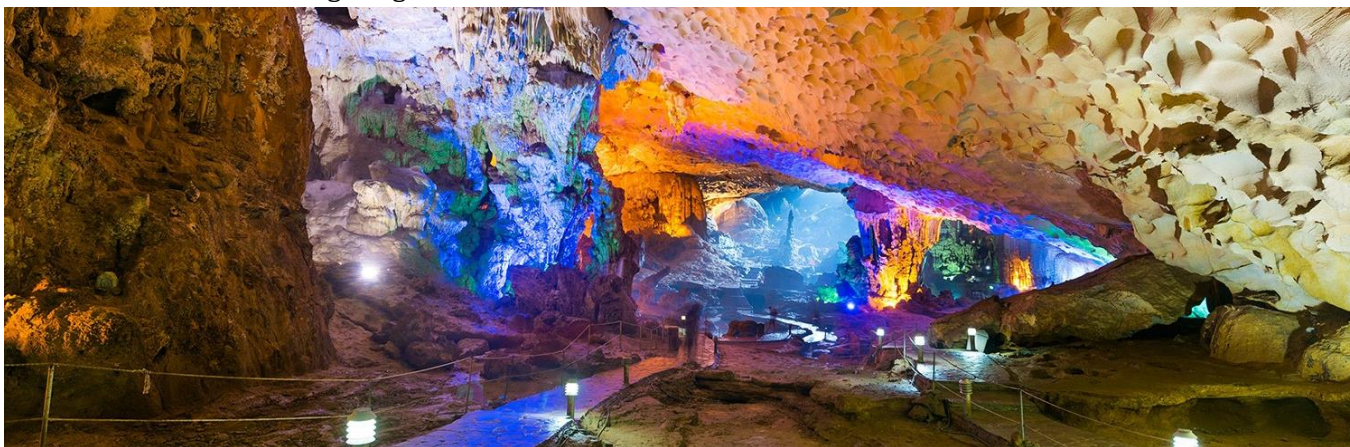
Thien Cung cave in Halong bay