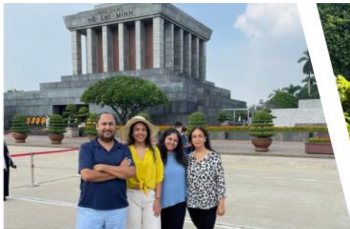
Ho Chi Minh Mausoleum