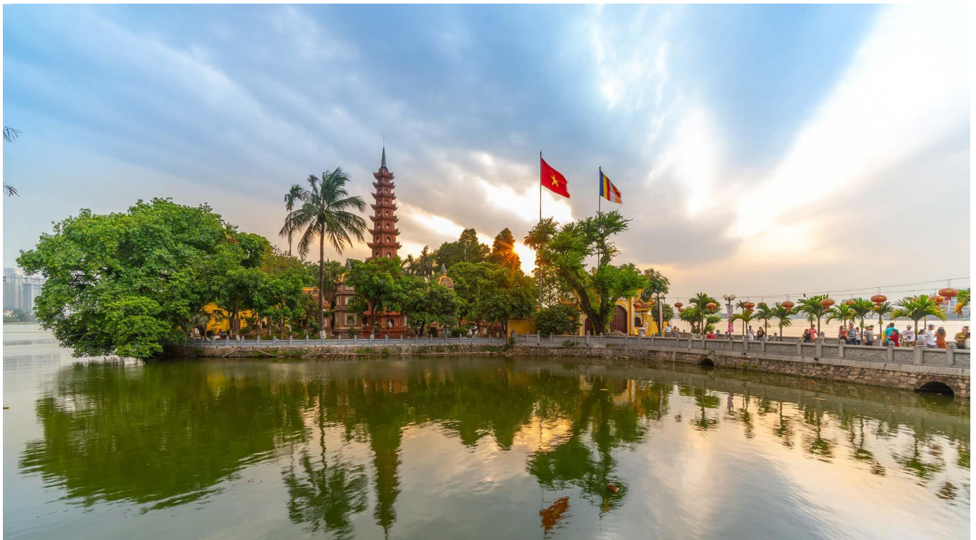
Tran Quoc Pagoda