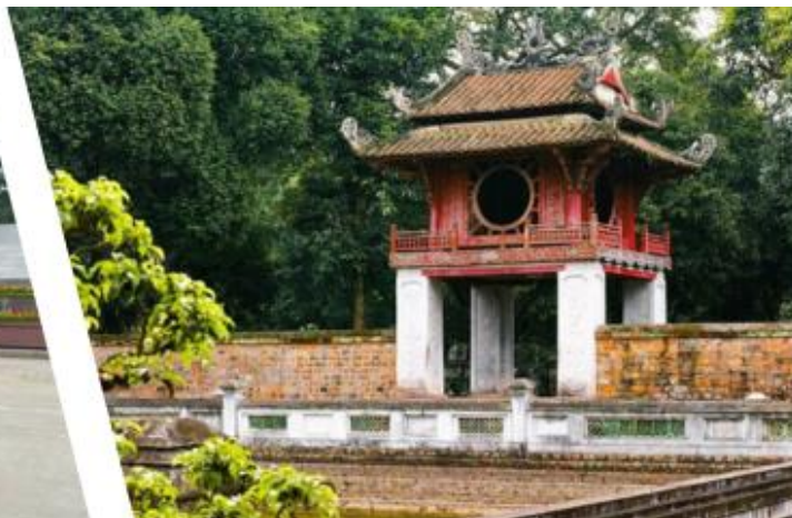
Temple of Literature

After lunch, transfer to Halong. Arrival Halong, check in hotel, the rest of day is at your own leisure.