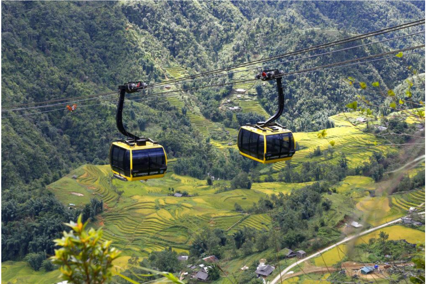
Fanxipan Cable Car

incredible mountain. The lush green and subtropical vegetation makes this mountain really very beautiful. Take some pictures for unforgettable experience from the top. After taking scenery then get cable car back to Sapa.